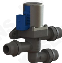
2位3通阀 2-Position, 3-Way Valve